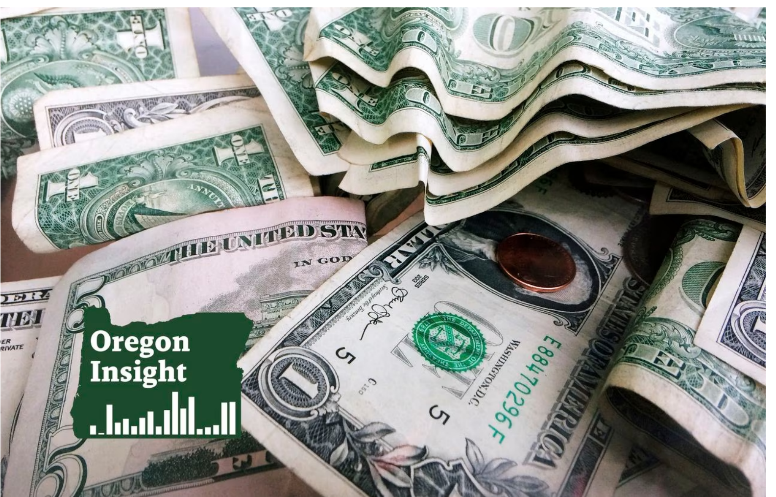
Oregon Insight is The Oregonian/OregonLive's weekly look at the numbers behind the state's economy. NEW!

Updated: Feb. 22, 2023, 10:05 a.m. | Published: Dec. 11, 2022, 7:05 a.m.